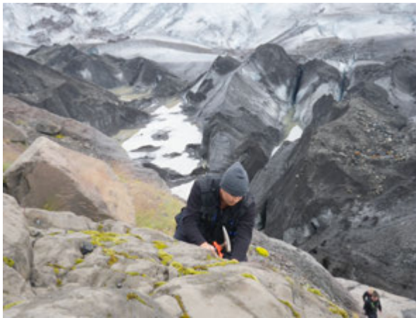
Figure 3: Geoff Cromwell sampling subglacial glass material in Iceland.